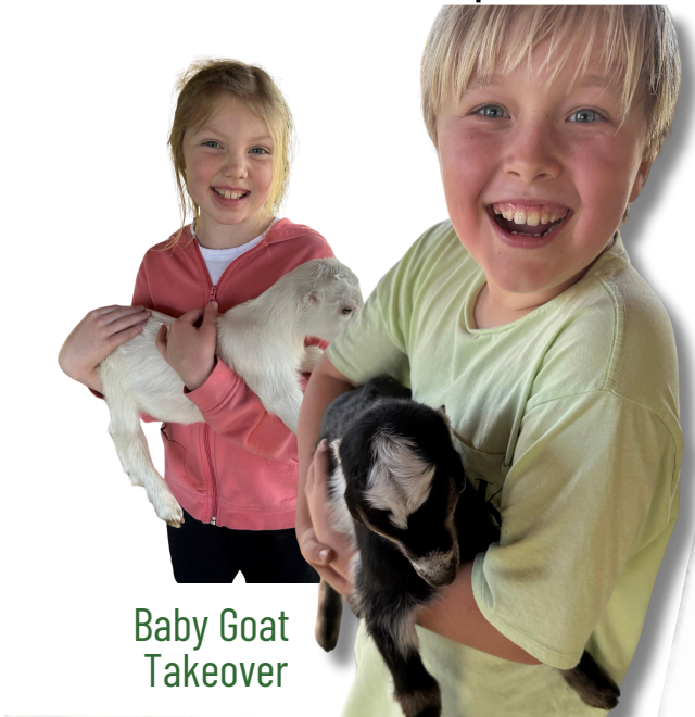
Baby Goat Takeover