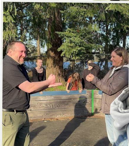
Rock, Paper, Scissors Teacher Competition