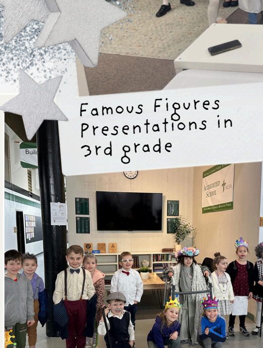
Famous Figures Presentations in 3rd grade