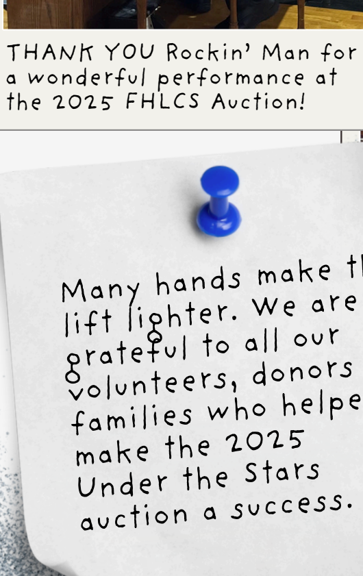
THANK YOU Rockin' Man for a wonderful performance at the 2025 FHLCS Auction!